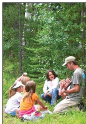
SPECIAL TO THE DAILY

It is the goal of the architectural team to achieve the U.S. Green Building