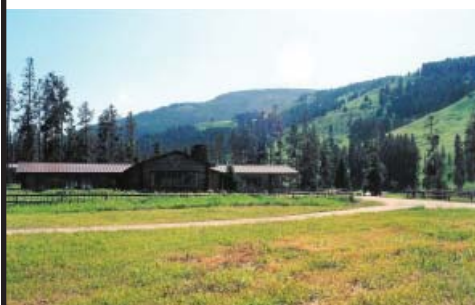
Main house at the Patten Ranch